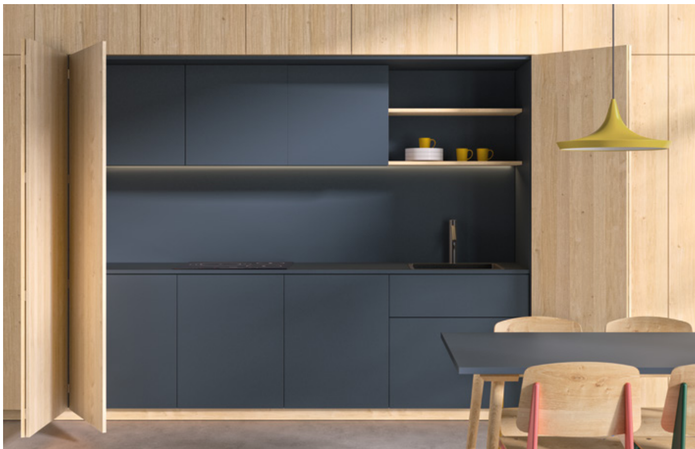
Kitchen in Azul Ceylan. Also stocked by Noyeks.