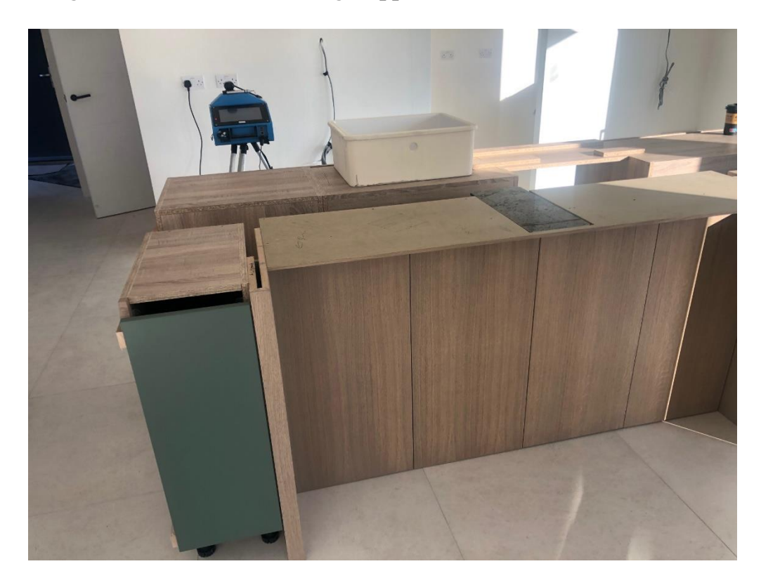
All images are used for reference for best practices for Ceramic Worktops