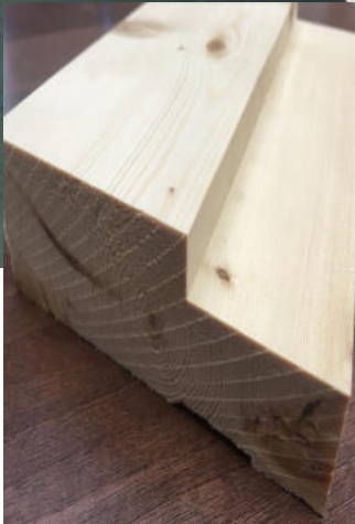
None fire rated